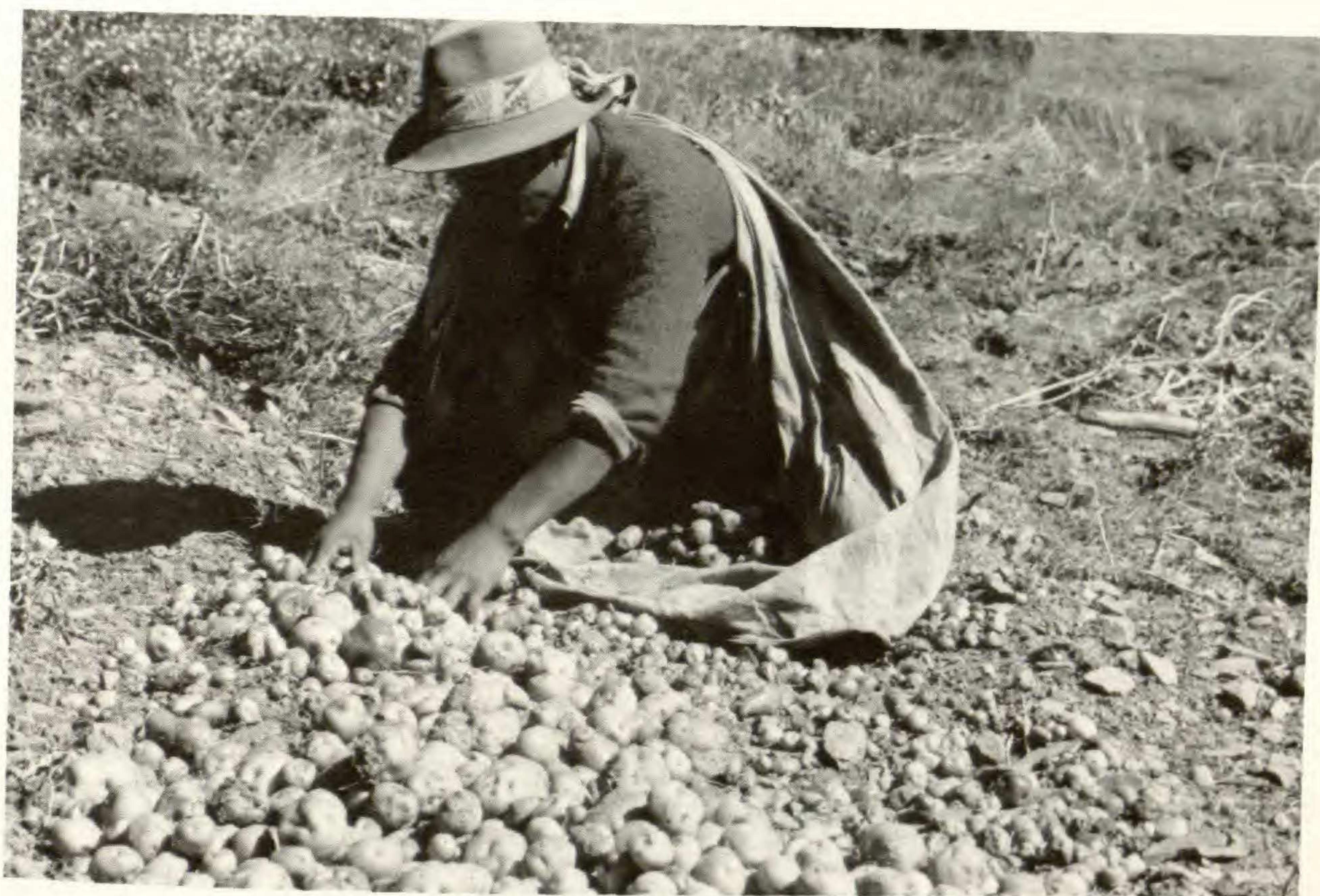
FIG. 2.—Agriculturalist in highland Paucartambo culling "third-class" potatoes at harvest.

cultivars in particular (Brush et al. 1981, Harlan 1975b; see also the discussion under Classification above). Sampling results indicated a mean of 21.1 cultivars per 225 plants. In addition to demonstrating the high degree of diversity, findings reveal a remarkable uniformity of cultivar variation within polycultivar fields. The sample's low standard deviation (5.1) indicates a pronounced evenness of diversity levels among parcels. Concerning spatial patterning cultivars within most "boiling potato" fields are distributed randomly, a pattern referred to locally as charqhosqa . Block-type patterning of cultivars ( taka-takasqa ) is limited to fields in high-elevation, eco-territorially "extended" peasant communities. 14